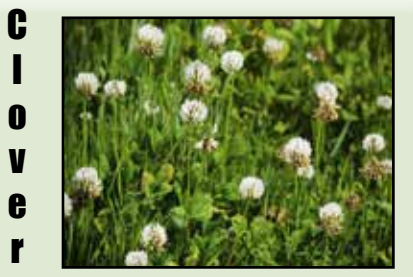
Clover used to be a common ingredient in lawn seed blends. These days, this perennial weed is regarded as a bad guy in most lawns. It tends to grow where soil is poor and low in nitrogen.