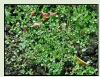
Chickweed is an annual weed that prefers shady, moist soil with higher fertility, although its seeds will sprout in dry soil. Typically, chickweed appears in lawns that are thin and experience poor drainage.